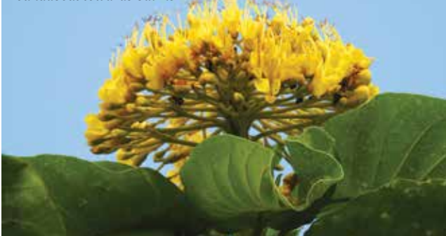
Deplanchea tetraphylla , plants at Smithfield roundabout towards Cairns

Known commonly as a Golden bouquet tree, mature trees have spectacular large bouquets of many yellow flowers. Naturally native and available at the nursery. Remove your African tulip trees and plant this instead.