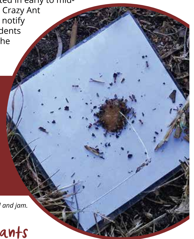
Lure survey using cat food and jam.