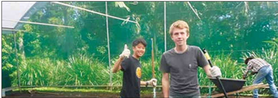
Photos: above Nursery re-vamp with Go Beyond students last Friday; below CAPTA Wildlife Habitat volunteers planting on the Barron last weekend

Oh, and stop clear felling what trees we currently have?