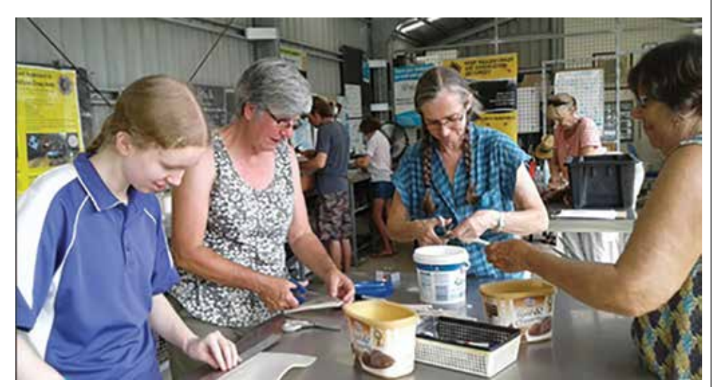
Kuranda Task Force cutting foam to be used in the sticky traps (Workshop # 8)

The current round of funding for the YCA Eradication Program is due to end 30th June. As part of a ten-year program the eradication program needs the other seven years to finish the job and it's on track to do just that. We are preparing for the best: fully funded; and planning for the worst: reduced funding. Our lifestyle is at risk if we don't eradicate YCA. You can support the YCA eradication program by signing up to be a task force volunteer on the envirocare.org.au website and following our Kuranda Community Taskforce Facebook page. If volunteering isn't an option for you, sign up and be informed. We will be calling on our community task force to help with the surveillance and treatment of YCA in our area. Our way of life will be at risk if we don't support the effective and successful work of the YCA Eradication Program thus far. We need your support.